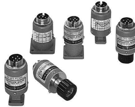
HP Thermistor Mounts